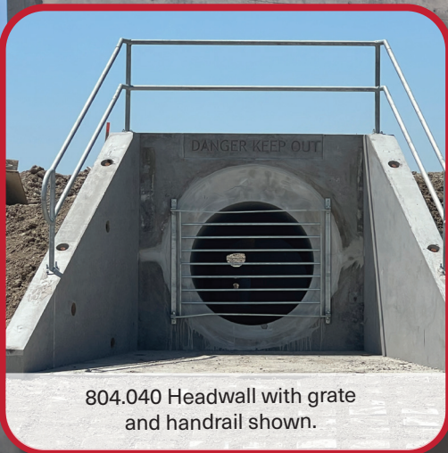
804.040 Headwall with grate and handrail shown.